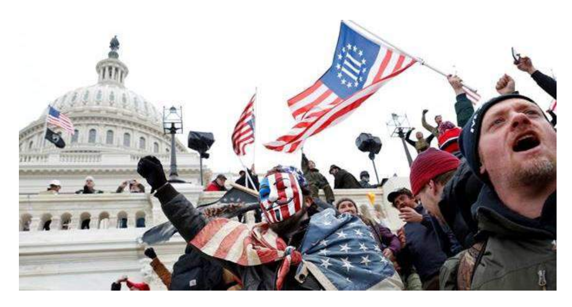
Pro-Trump rioters at Capitol Hill on 6 January 2021

FBI Follows Trails on Social Media, 300 of the 800 Rioters Arrested, Many at Large