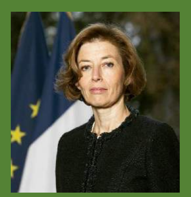
French Defence Minister Florence Parly

Following a bilateral meeting held on 9 July 2021 at the Pentagon, US Secretary of Defense Lloyd Austin and his counterpart, French Minister of the Armed Forces Florence Parly, signed a Franco-American roadmap for increased cooperation in special operations.