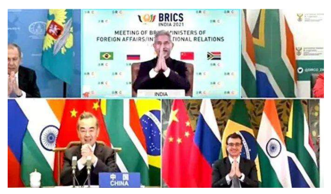
Foreign Ministers of Brazil, Russia, India, China, and South Africa at virtual BRICS summit.

Plan Key Deliverable under India's Chairship: MEA