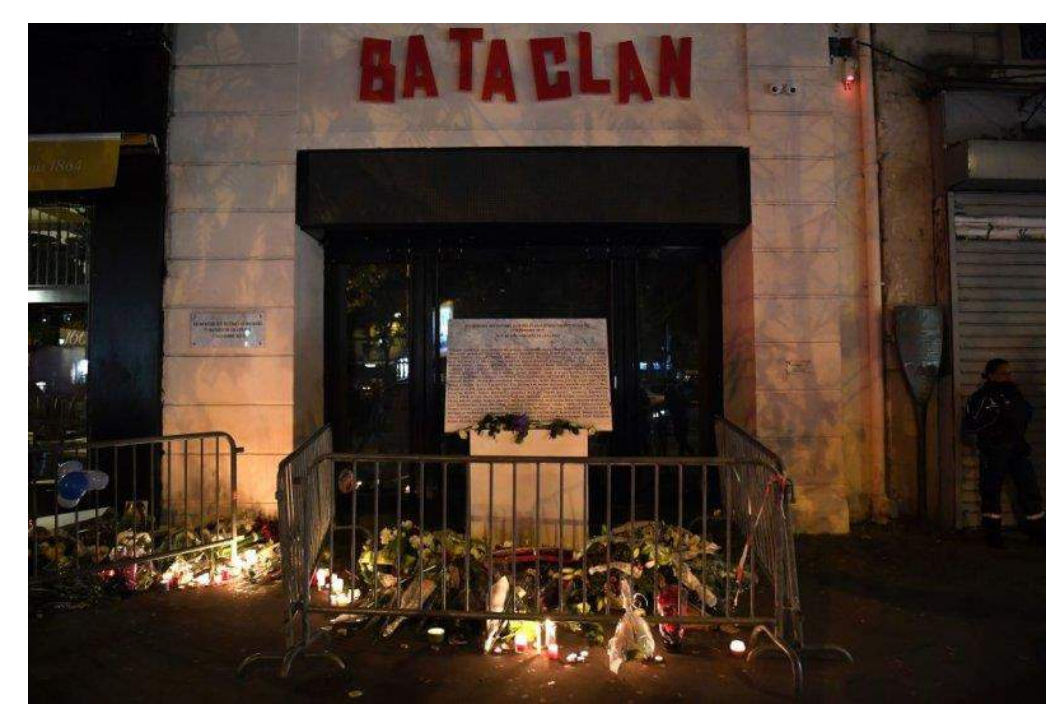
A shrine set up after the November 2015 attack at Bataclan theatre in Paris.

NEW LAWS ON ONLINE SURVEILLANCE, AGAINST RADICAL IDEAS PASSED