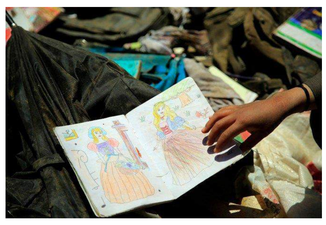
Notebooks of schoolgirls found strewn across a blood-stained road outside the school.

On 9 May 2021, a car bomb and two mine explosions near a school in Kabul killed at least 68 people and injured 165 others, according to Afghan officials. Majority of deaths are reported to be of schoolgirls at the Dasht-e-Barchi neighbourhood of the capital city, home to a large community of Shia from the Hazara ethnic minority.