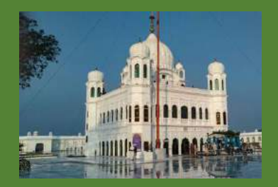
Gurdwara Darbar Sahib, Kartarpur, Pakistan

On 24 May 2021, the Sikh community in Pakistan received a threatening message from a Taliban-affiliated terrorist group Baluchistan Republic Army (BRA).