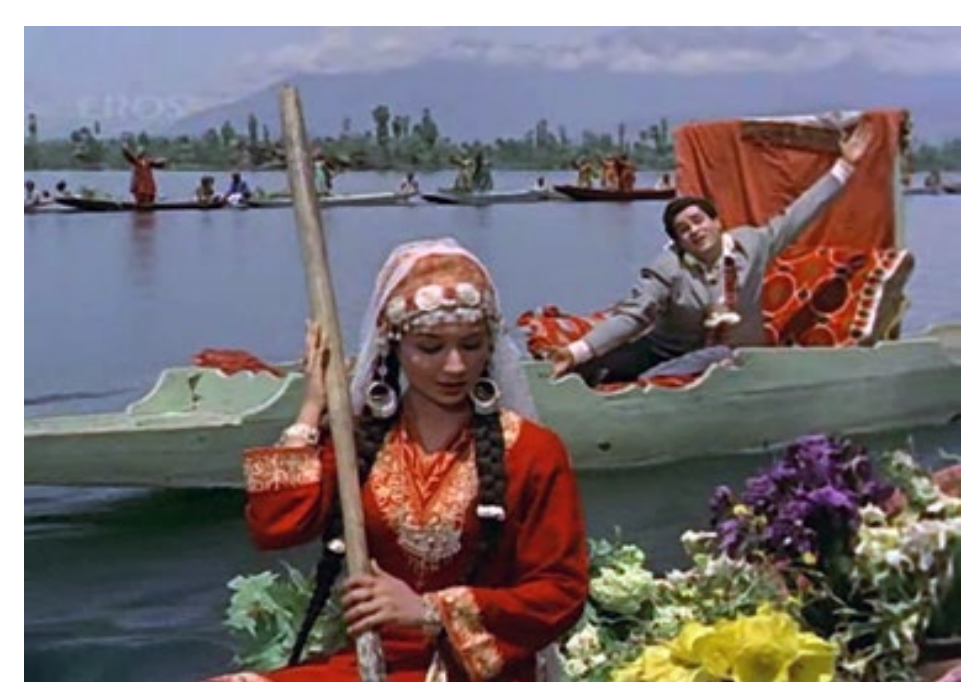
The iconic romantic scene from 'Kashmir ki Kali' made the Dal Lake popular in the Indian popular imagination. The allure of Kashmir has always drawn film makers and cineaste to the irresistibly beauteous valley.

Jammu and Kashmir administration has approved a new film policy with an aim to position the Union Territory as a hub of cinematic creativity and productivity, officials say.