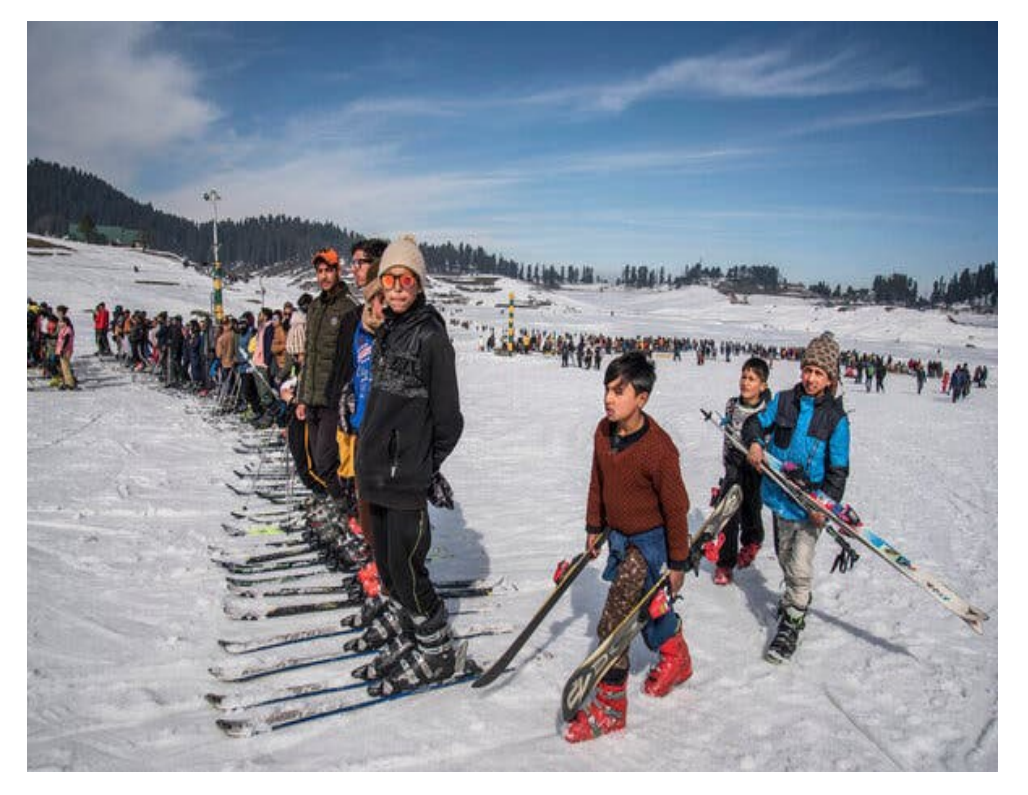
Long line for a ski lift in Gulmarg — File Picture

On the picturesque town of Gulmarg, famed for its breathtaking views, adventure seekers and nature enthusiasts turned out in large numbers after a recent snowfall ended over a two month dry spell.