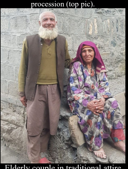
Elderly couple in traditional attire