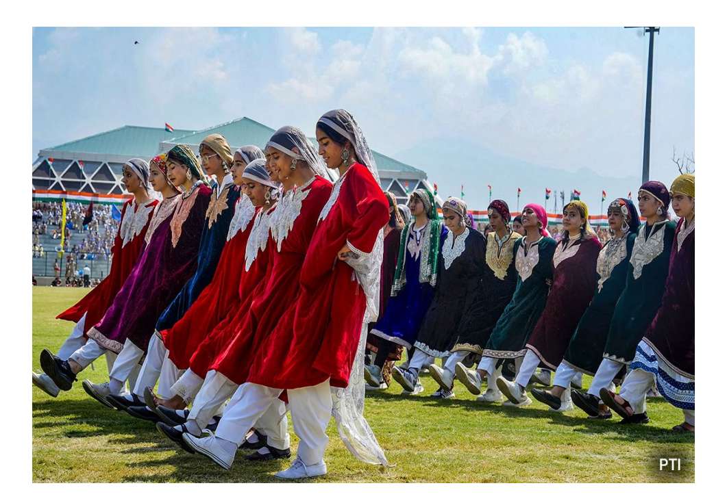
Girls in traditional Kashmiri costumes dance during Independence Day celebrations at the Bakshi stadium in Srinagar.

The Bakshi stadium in Srinagar witnessed a huge rush for celebrations held there on Independence Day. Long lines of people queued outside the stadium, even as massive crowds waved the national tricolor at the city's iconic Lal Chowk.