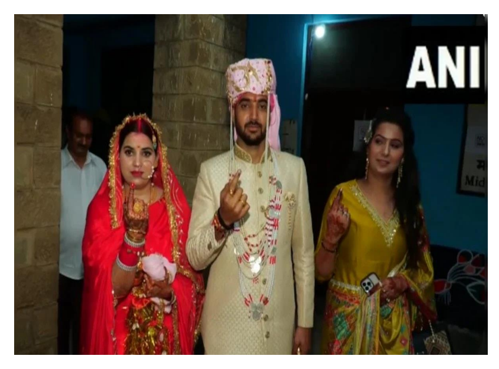
The newlyweds making the right start by availing their democratic right to ensure a prosperous future.

Accompanied by his friends, dressed in traditional attires, a groom decked up in sherwani and colourful headgear was among the first to cast his vote at a polling booth in Jammu and Kashmir's Udhampur as the first phase of the Lok Sabha election began on 19 April.