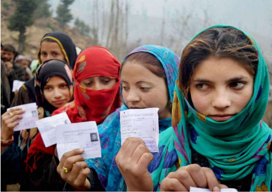
Women voters queuing up to cast votes in an earlier election held in Jammu and Kashmir.

Union Home Minister, Mr. Amit Shah, announced during his two-day visit to Jammu and Kashmir (J&K) that the Union Territory would go to polls after the declaration of the final electoral lists.