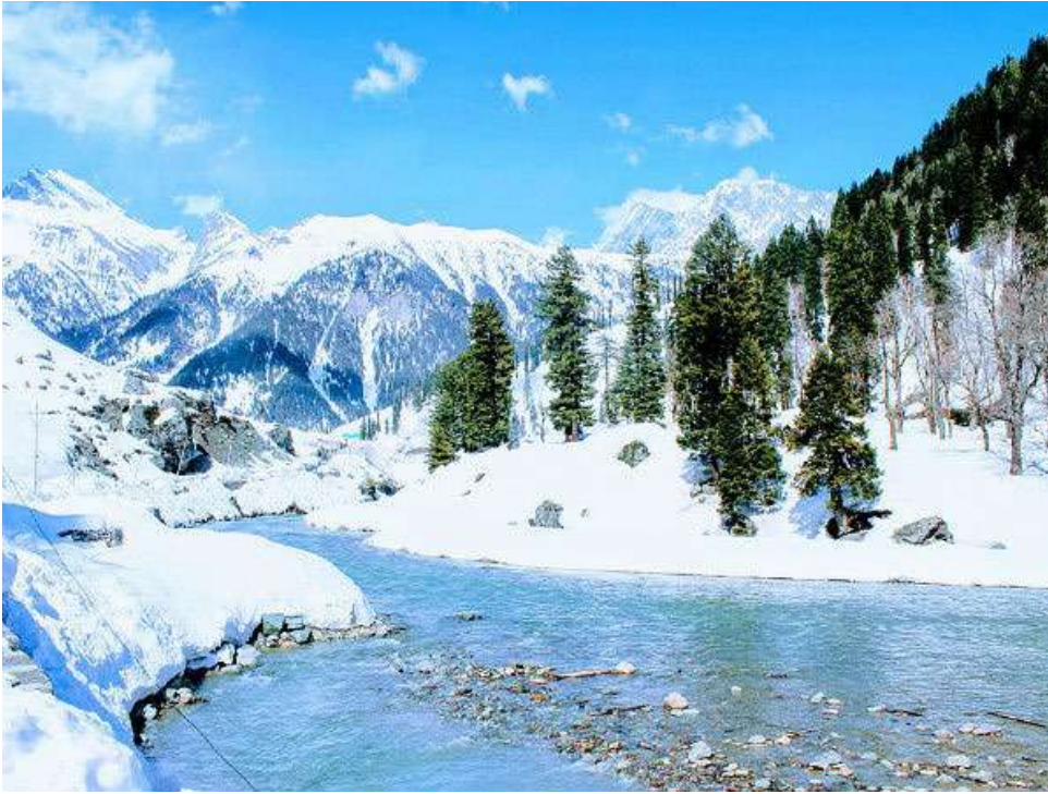
Representative picture of J&K's famed scenic views