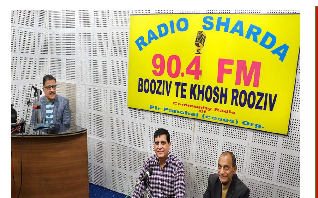
Broadcasting on 90.4FM, Radio Sharda airing views of the Kashmiri Pandit community under the tagline 'Booziv Te Khosh Rooziv' (Listen and Be Happy)'.

R adio Sharda, a community radio station based in Jammu, has become a significant platform for the Kashmiri Pandit community as people from different parts of the world listen to it to reconnect with their heritage and traditions.