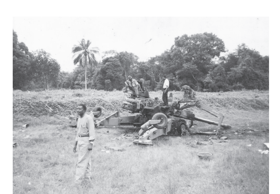
Figure 2 FH77 Bofors Gun of Nigerian Contingent of ECOMOG Destroyed by Fighters in Tubmanburg in April 1996