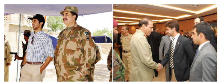
Figure I ISPR Intern with Lt Gen Bajwa (L) and Former COAS, General Ashfaq Kayani (R), 2012