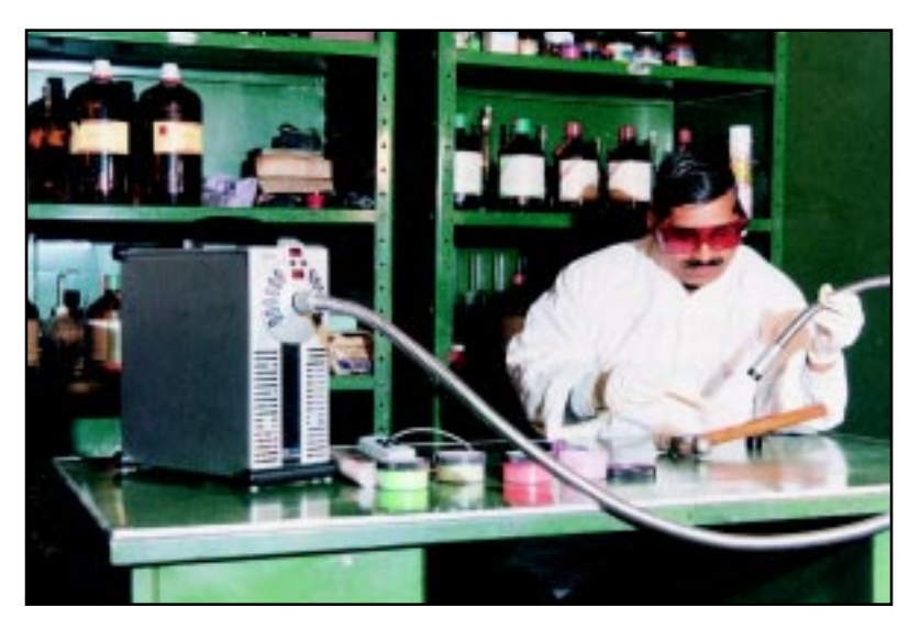
Latest finger print detection on crime exhibit

6.81 Central Forensic Science Laboratory, under the Ministry of Home Affairs, renders scientific forensic service and crime exhibits analysis in actual crime cases referred by CBI, Delhi Police, Vigilance Departments of Ministries & PSUs, State/Central Govt. Departments, Judiciary and State Forensic Science Laboratories. The laboratory provides independent scientific expert opinion in crime cases and scientific support