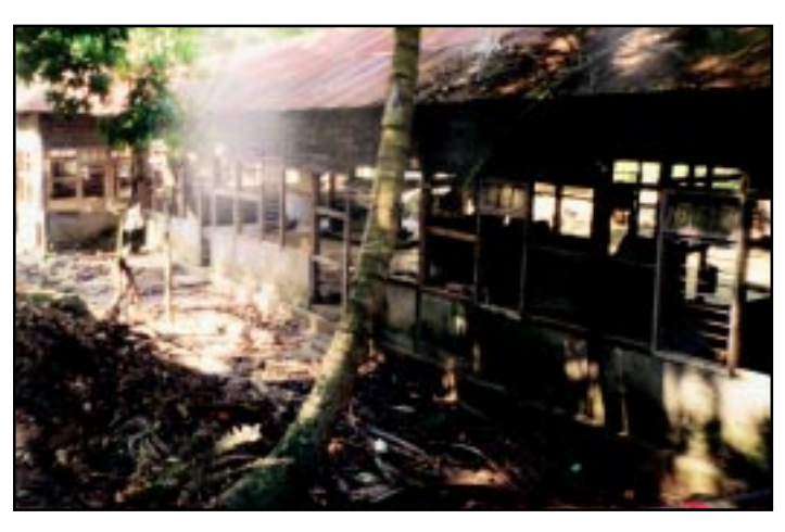
Destruction caused by Tsunami in Nancowry