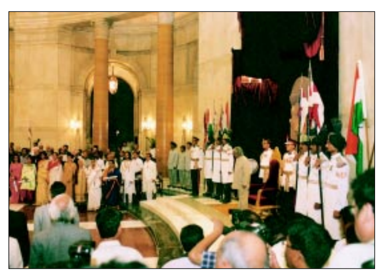
Investiture ceremony for comferment of Padma Awards

8.5 Padma Awards announced on Republic Day, 2004 were conferred by the President at an Investiture Ceremony held at Rashtrapati Bhavan, New Delhi on June 30, 2004. The awards were conferred on 96 persons (Padma Vibhushan-3, Padma Bhushan-19 and Padma Shri-74). Out of the 96 recipients, 21 were women. The names of the recipients are available on the Ministry's website.