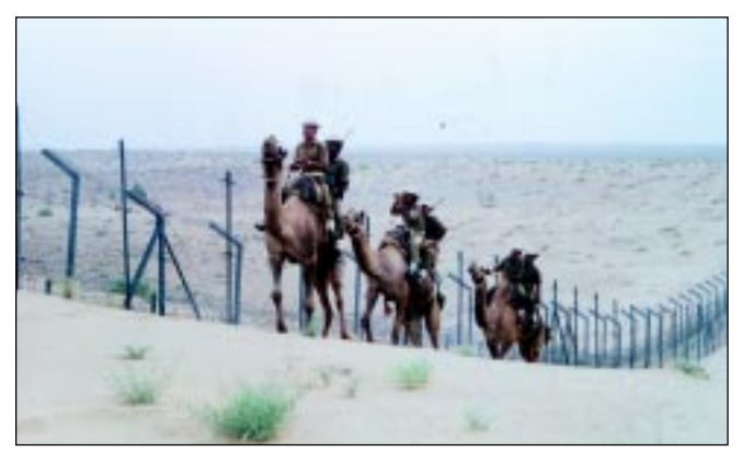
Camels patrolling Indo-Pak Border in Rajasthan

Gujarat and Jammu sectors. Over 1712 km out of the total length of 3287 km of Indo-Bangladesh border has also been fenced and a pilot project of flood-lighting along 126 km has been taken up during the current financial year. To check antinational activities and improve security along Indo-Nepal and Indo-Bhutan borders, Sashtra Seema Bal has been deployed on these borders. It has also been decided to fence certain sensitive segments of Indo-Myanmar border.