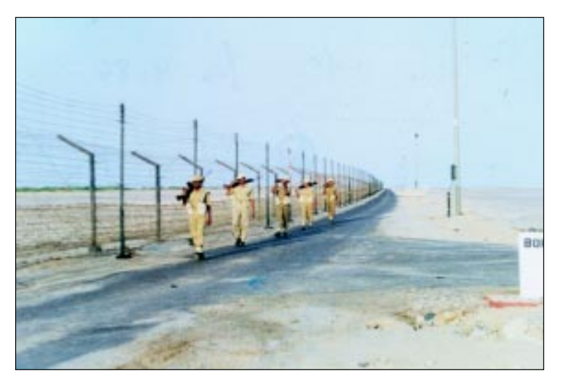
Foot patrolling along Indo-Pak border in Rajasthan

4.87 In order to check anti-national activities from across Gujarat border, the Government has approved a comprehensive proposal for the construction of fencing, flood lighting on a raised embankment, construction of link roads, Border Out Posts and border roads in 310 kms of Gujarat sector. So far, 68 kms of fencing and 64 kms of floodlighting has been completed. National Building Construction Corporation (NBCC) has been allocated fencing works in 124 kms stretch to expedite the work.