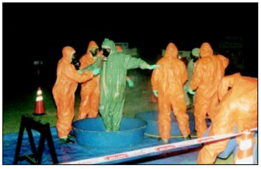
Mock drill of Civil Defence Operations during nuclear emergencies

7.11 The two war emergencies faced by the country in 1962 and 1965 compelled the Government of India to reorient its emergency training activities from natural disasters to those concerning protection of life and property against enemy actions. This college was renamed as National Civil Defence College with the passing of Civil Defence Act, 1968 by the Parliament.