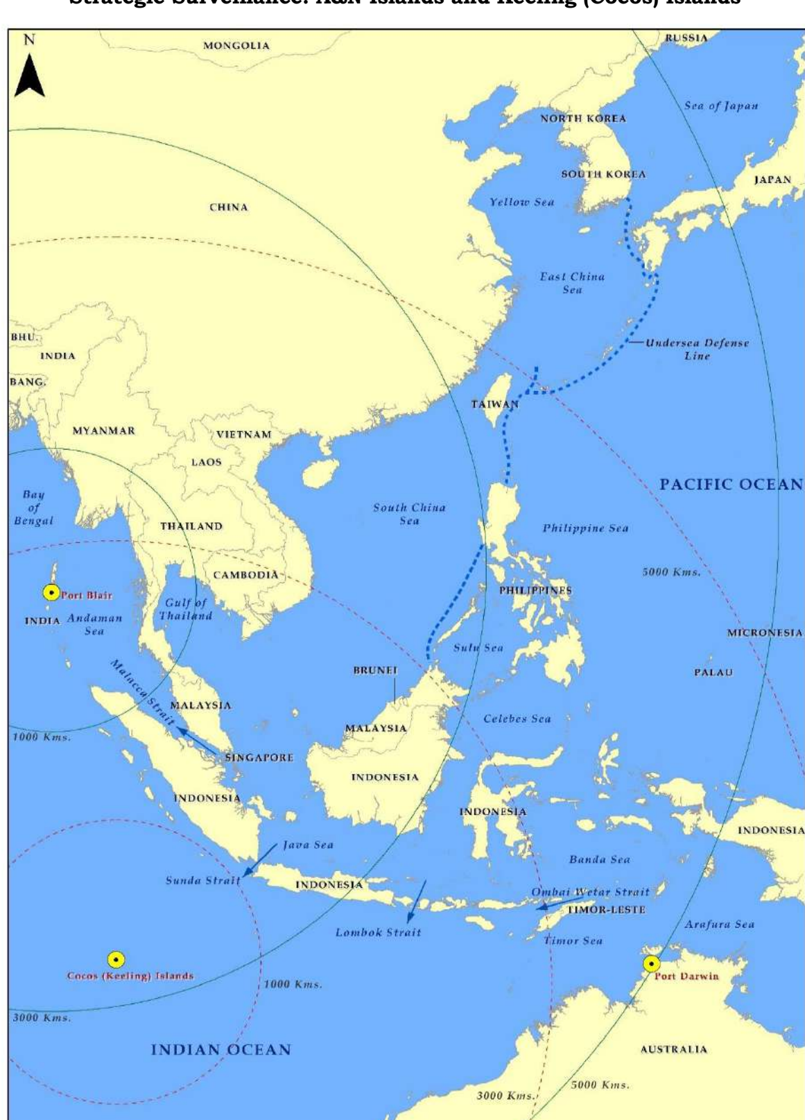
{\it Appendix}\ B Strategic Surveillance: A&N Islands and Keeling (Cocos) Islands

@ Manchar Parrikar Institute for Defence Studies and Analyses, GIS Section. Map not to scale.