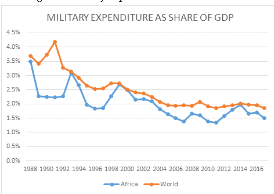
Figure 3: Military Expenditure as Share of GDP

Military expenditure as a share of GDP is an important parameter and often utilised as a benchmark in assessing international military spending. On this account, Africa is spending a lower share of its GDP than the world average (Figure 3). In the last three decades, the share of GDP the world spent on the military has come down from over 3.7 per cent to 1.9 per cent in 2017. Africa's military expenditure nearly matches the world trend reaching 1.5 per cent of its GDP in 2017. For developing and underdeveloped countries, this still is a huge financial burden and needs to be further corrected.