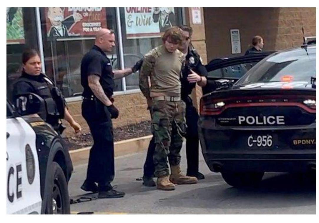
A picture grab from Facebook shows police apprehending suspected teenage shooter

ATTACK REPORTEDLY INSPIRED BY FAR-RIGHT CONSPIRACY THEORY