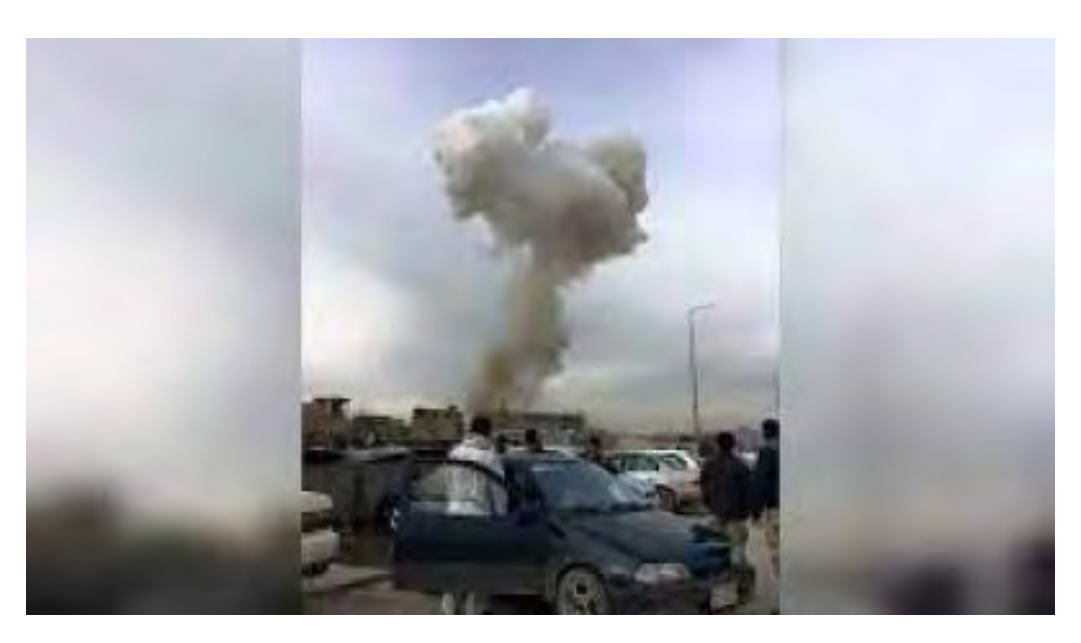
A mushroom cloud rises from an explosion that killed several people at Kabul's military airport on 1st of January 2023.

I SIS Khorasan (ISIS-K) has claimed responsibility for a bombing near a checkpoint at the Afghan capital's military airport that killed and wounded several people. ISIS-K said in a statement that the 1<sup>st</sup> of January 2023 attack on the checkpoint in Kabul was carried out by the same member who took part in an assault on a hotel in the capital in mid-December (read that story in the inset).