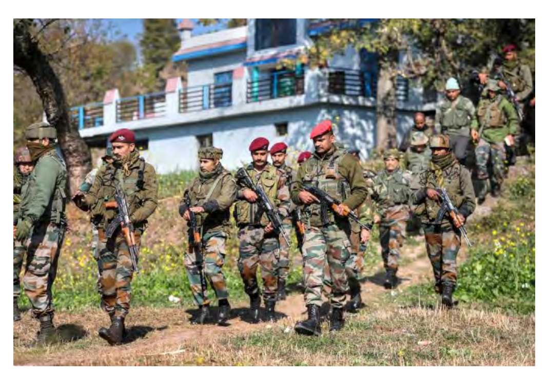
Indian Army personnel during a search and cordon operation after the killings of civilians in Dhangri village in Rajouri, Jammu and Kashmir.

18 CRPF COMPANIES RUSHED TO POONCH AND RAJOURI DISTRICTS