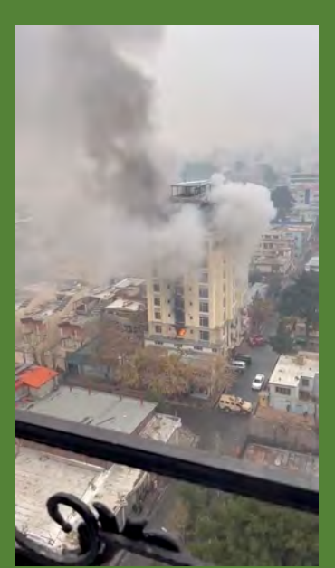
View of the hotel following the ISIS-K terrorist attack.

On 12 December 2022, ISIS Khorasan (ISIS-K) terrorists attacked Longan hotel in central Kabul. Local residents claimed that they heard rounds of gunfire following heavy The explosion. assault ended after three gunmen were killed by the Taliban forces.