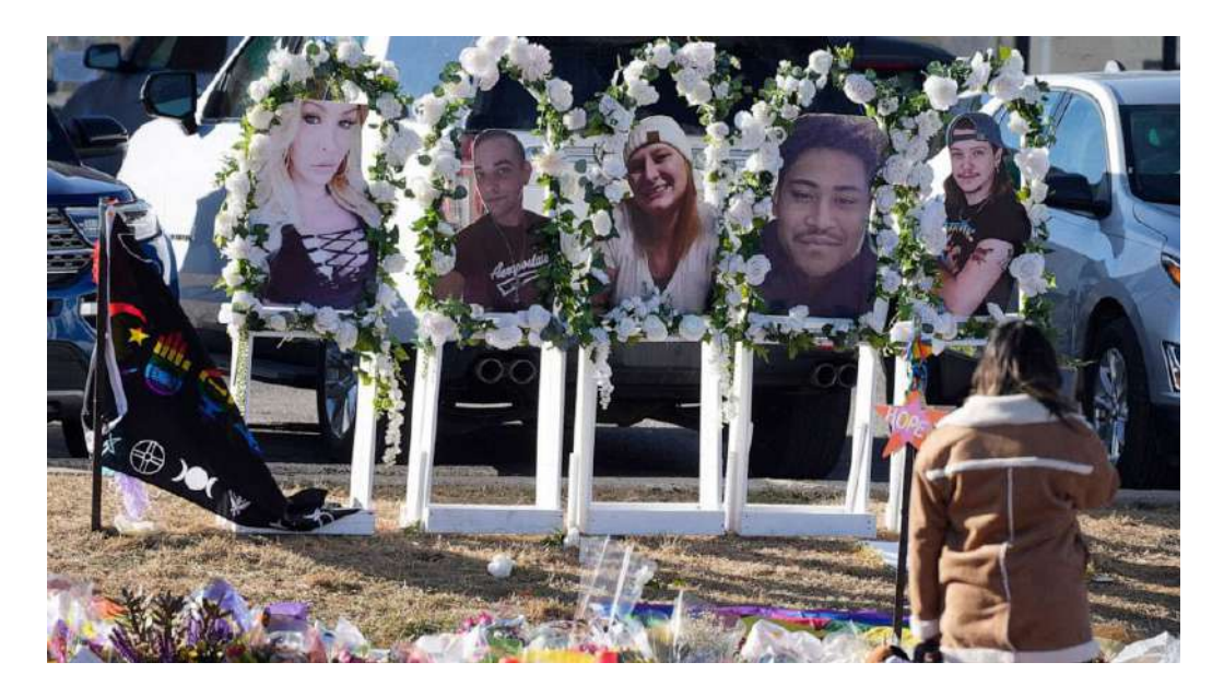
Portraits of the victims of the mass shooting at the Club Q nightclub are displayed at a memorial, Nov. 22, 2022, in Colorado Springs, Colo.

22-YEAR-OLD ALLEGEDLY FIRED SEMI-AUTOMATIC WEAPON AT LGBTQ CLUB