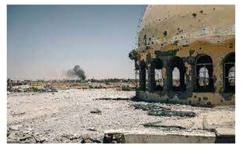
The shattered dome of a mosque in war-torn Syria. - Representation image

US MILITARY CLAIMS TERROR HONCHO KILLED BY FREE SYRIAN ARMY