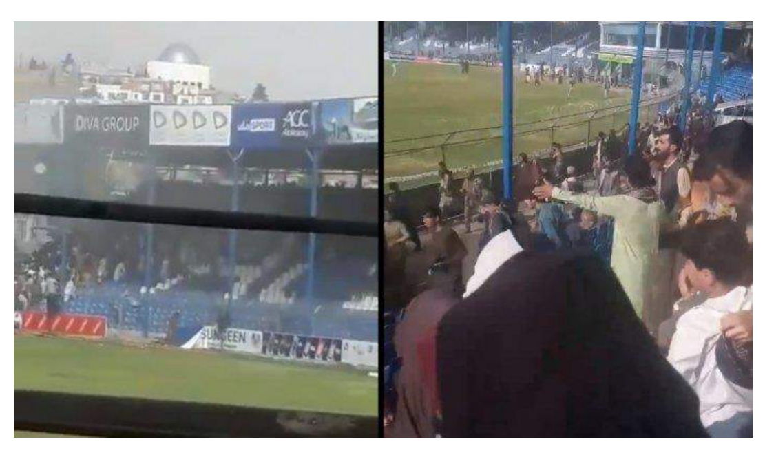
Two pictures taken at the scene of the blast and spectators panicking on the other side of the Kabul International Cricket Stadium on 29 July 2022.

A grenade explosion during a match at Afghanistan's main cricket stadium injured four spectators and briefly halted the game on 29 July 2022, officials and police said. The explosion happened at a match between Pamir Zalmi and Band-e-Amir Dragons in the country's domestic T20 league, held at the Kabul International Cricket Stadium.