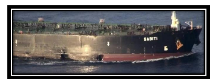
This photo released by the official news agency of the Iranian oil ministry, SHANA, shows the scene of damage caused by two missiles that allegedly struck the Iranian oil tanker Sabiti, at the Red Sea.

Preliminary analysis of the Sabiti incident indicates that the ship was transiting back to Iran through the busy shipping route of the Red Sea, after having discharged its crude in Syria. A missile attack seems unlikely considering the minimal extent of damage. This, along with the fact that the ship was underway within a short time, appears to rule out the use of missiles in the attack.