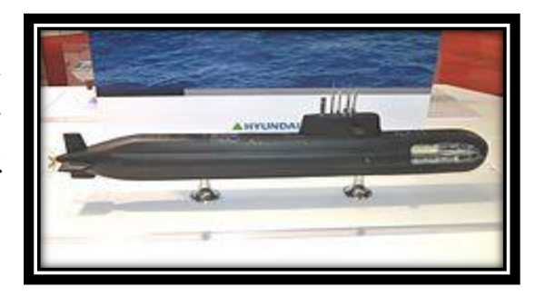
KSS III Model

In a report submitted to South Korea's National Assembly, the Republic of Korea Navy has stated that it has established a task force headed by a commander-level official to examine the procurement of nuclear-powered submarines in the long term. This may be the first time that South Korea has publicly spoken of acquiring nuclear submarines.