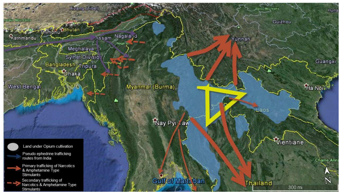
Figure I: Flow of Drugs in the Golden Triangle and Northeast India

their own "tax structure" help to exacerbate the problem. Pseudoephedrine is smuggled from New Delhi to Myanmar and China via Guwahati by conduits based in Nagaland, Manipur and Mizoram ( See Figure I )