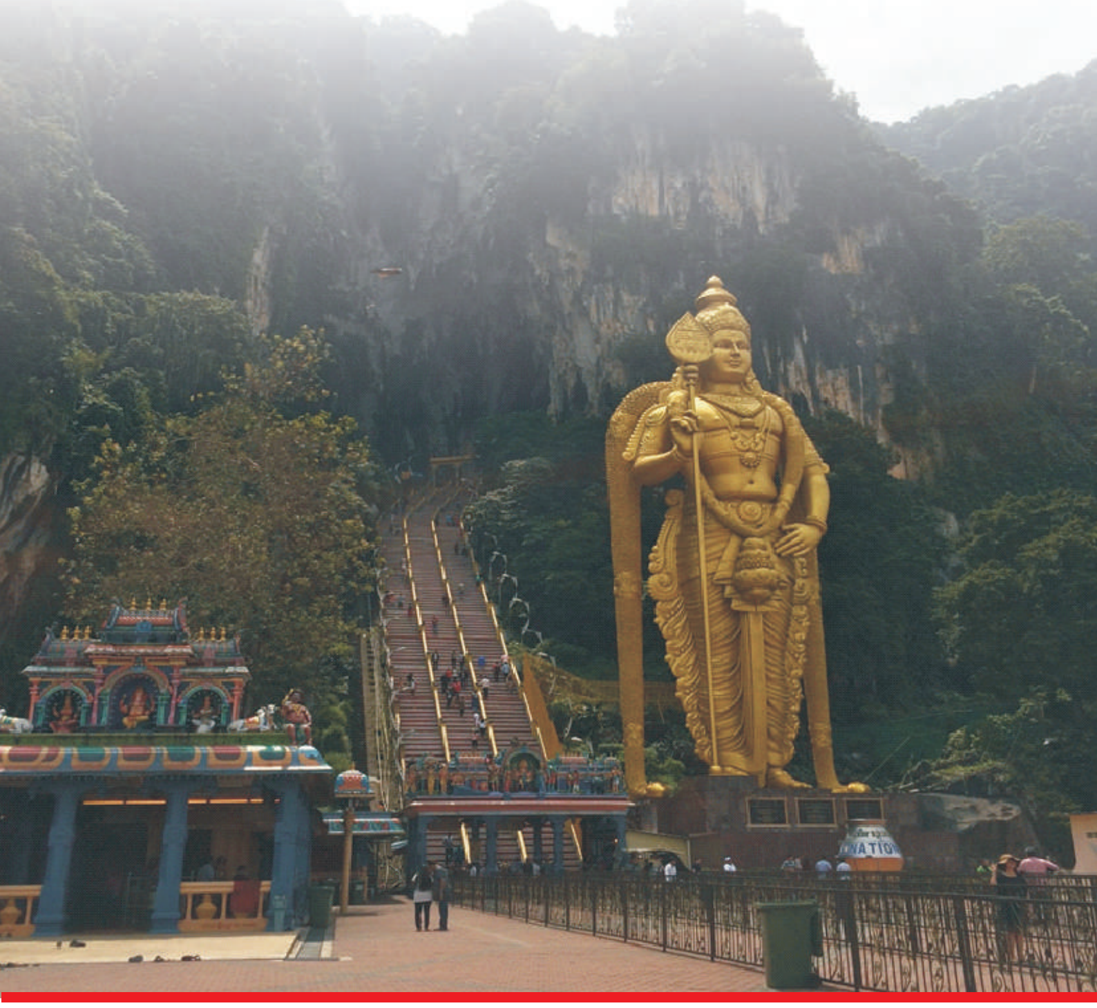
Batu Caves, a popular symbol of cultural links between India and Malaysia.

Southeast Asia & Oceania Centre Bimonthly Newsletter