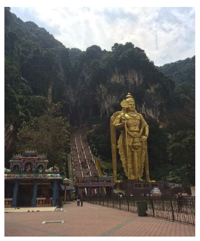
Batu Caves, a popular symbol of cultural links between India and Malaysia.

"We have had our cultural and historical ties over centuries, but what excites us is the future. People here (in India) are more confident of the future and this is why we have decided that India will be a major strategic partner for Malaysia."-Malaysian Prime Minister Mohd. Najib (2010).