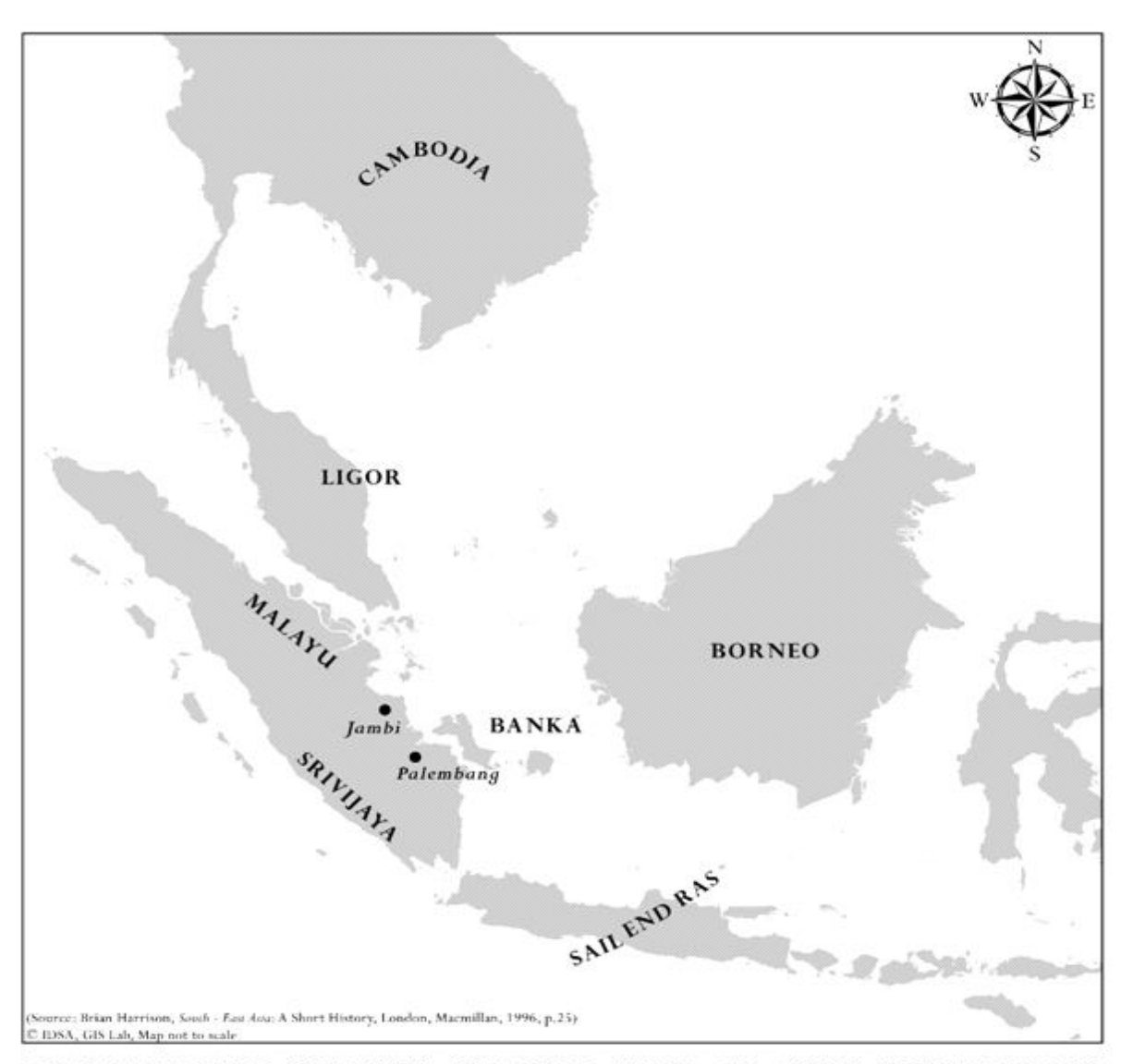
Map No. 1

INDIANIZED STATES OF THE 7TH TO 9TH CENTURIES