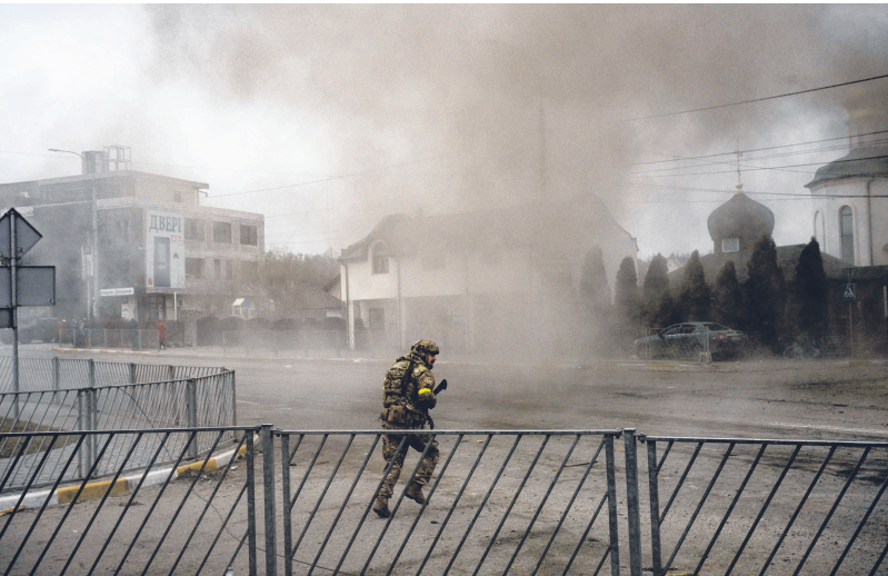
A Ukrainian soldier running to check on a family after a mortar round landed nearby as civilians tried to flee Irpin, a Kyiv suburb, on Sunday.