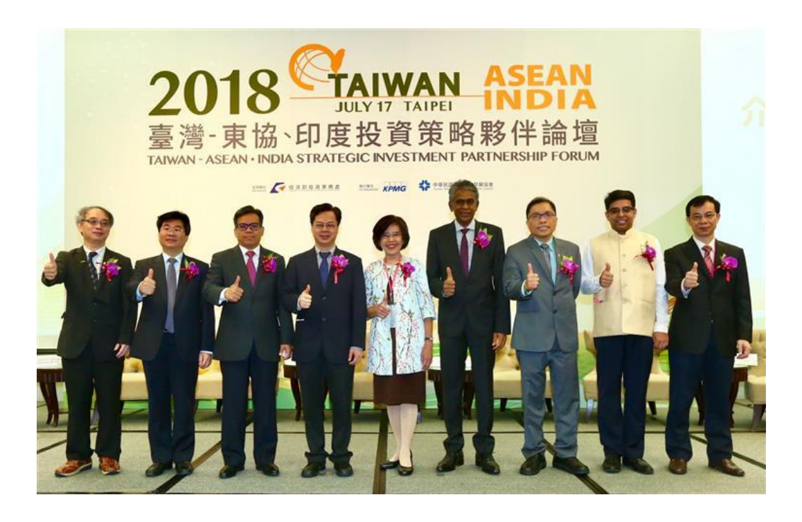
Taiwan-ASEAN-India Strategic Investment Partnership Forum hold by Ministry of Economic Affairs in Taipei on July 17, 2018.

Partnering with the AAGC will help the Taiwanese people to be better represented through a consultative framework across Indo-Pacific. The scope to cooperate better in regional mechanisms and multilateral institutions will amplify Taiwan's international image as a distinct territory, if not an independent territory. Notably, AAGC and NSP are complementary because both are long-term policy propositions, based on multi-pronged developmental plans. Unlike the NSP, the AAGC might be an international co-envisioned multilateral proposition. But there is no doubt that the policy focuses of the NSP and AAGC are almost in similar line, complementing each other. Greater convergence among resources, markets, talents, companies and organizations will only strengthen chain of growth and developmental networks in Indo-Pacific.