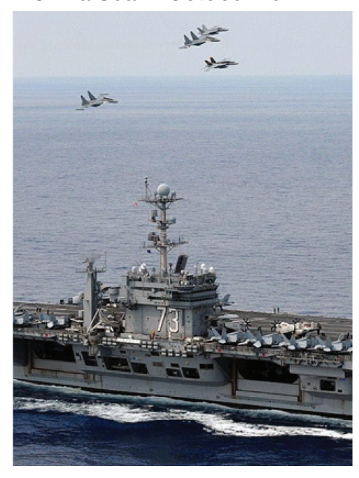
Fig. 3 Malaysian and US fighter aircraft flying in formation over USS George Washington of the US Navy in South China Sea in October 2012. 48

This was one rare occasion of direct US military posturing in the regional dispute to allay fears of some countries about China's possible military ventures, which could potentially rout them from any of their current positions in the disputed waters. In fact, during this activity, some Vietnamese security and government officials were flown on to the US nuclear powered carrier for the second time after 2011; also, two F/A-18E fighter aircraft of the US flew in formation with two Su-30 fighters of the Malaysian Air Force during the event.