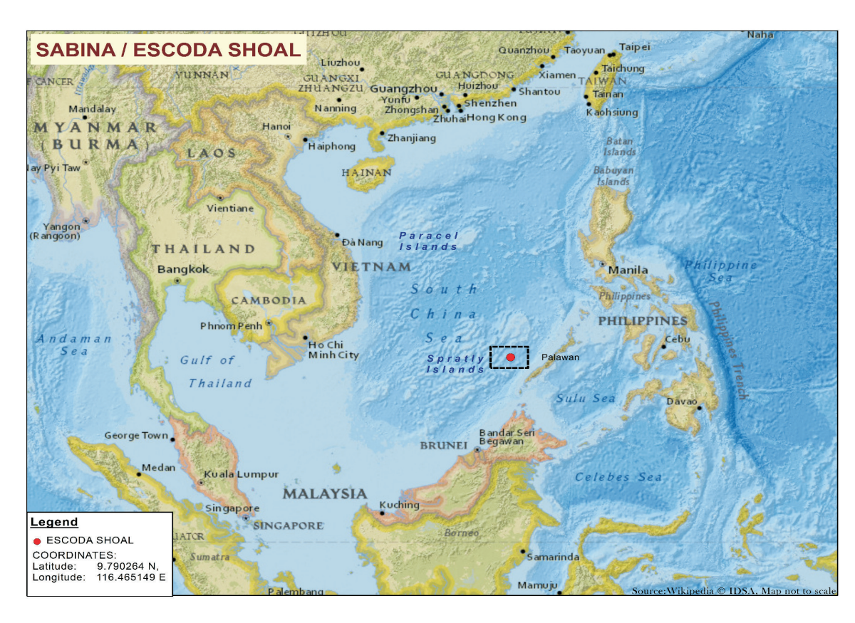
Fig. 1 Escoda Shoal<sup>10</sup>

tendering activity illegal. A former Chinese ambassador also suggested joint exploration and urged the Philippines to engage with China bilaterally without involving the US.<sup>12</sup>