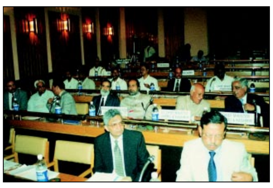
Meeting of the Inter-State Council on August27-28, 2003 held in Srinagar.

5.3 In the 8th meeting of the Inter-State Council held on August 27-28, 2003, the Council considered the remaining 17 recommendations of Sarkaria Commission relating to 'Administrative Relations', 'Emergency Provisions' and 'Deployment of Union Armed Forces' as well as the report of Sub-Committee on 'Contract Labour/ Contract Appointments' and the 'Action Plan on Good Governance'.