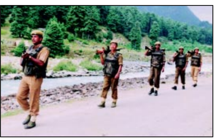
Road opening party of CRPF during Amarnathyatra 2003

6.19 CRPF personnel are on continuous vigil in various sensitive areas. They are performing guarding duties at some of the vital installations/buildings including shrines, temples like Mata Vaishno Devi and Raghunath Temple in Jammu, Ram Janam Bhoomi/Babri Masjid in Ayodhya, Kashi Vishwanath Temple/Gyanvapi Mosque in Varanasi and Krishna Janam Bhoomi/Shahi Idgah Masjid in Mathura.