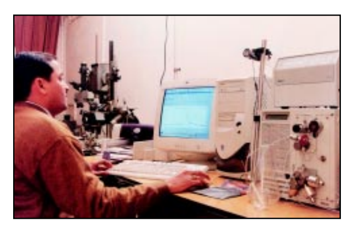
Analysis of High Explosive substance by High Pressure Liquid Chromatozraphy system in CFSL (CBI), New Delhi

6.86 Central Forensic Science Laboratory, CBI, New Delhi is a scientific laboratory under the Ministry of Home Affairs rendering scientific forensic service and crime exhibits analysis in actual crime cases referred by CBI, Delhi Police, Vigilance, State/Central Government Departments, Judicial Courts and State Forensic Science Laboratories. The Laboratory provides independent scientific expert opinion in crime cases and scientific support service to detect physical clues at the scene of crime. The laboratory also provides expert testimony in judicial courts and imparts forensic training to Investigating Officers and Scientists. The laboratory also undertakes research and developmental activities in forensic science and publishes a quarterly "Forensic Science & Technology News Digest" to meet the scientific support requirements in CBI case investigation.