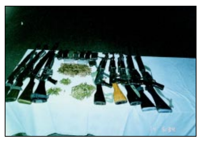
Weapons captured/recovered by Tripura Range Assam Rifles.

6.13 Known as 'Friends of the Hill People', Assam Rifles, raised initially as Catcher Levy in 1835, is the oldest Police Force in the country with headquarter at Shillong. It has 1 Inspectorate General, 9 Ranges, 41 Battalions, 1 Training Centre and School, 3 Maintenance Groups, 3 Workshops, 1 Signal Unit, 1 Construction Unit and a few other ancillary units. The force has a duel role of maintaining internal security in the North Eastern region and guarding the Indo-Myanmar Borders. The force also participated in operations in Jammu & Kashmir and Srilanka in conjunction with the Army. During the period from April 1, 2003 to March 31, 2004, the Force captured large quantity of arms and ammunition, besides killing 114 and