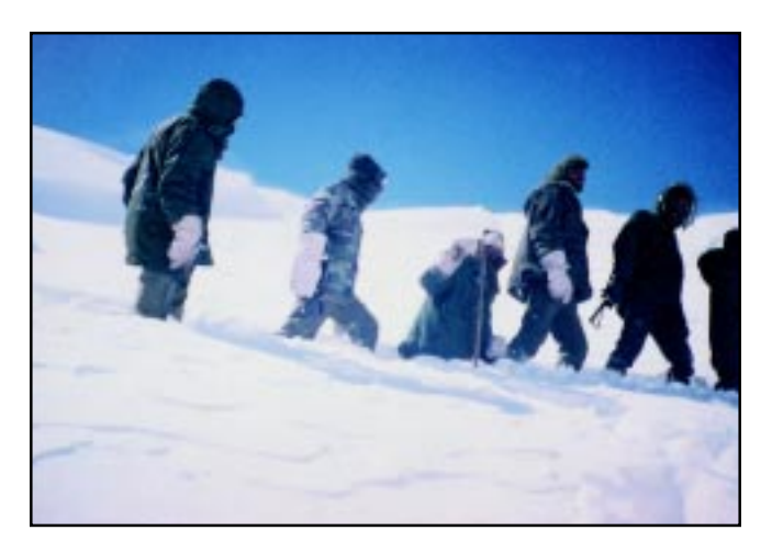
Patrolling in Snow by ITBP Troops

besides providing assistance in Disaster Management in the central and western Himalayan regions.