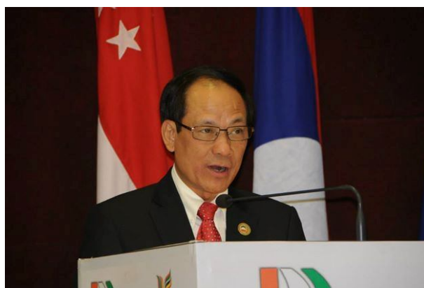
Photo 4: ASEAN Secretary General Mr. Le Luong Minh Addressing the Audience at IDSA on 7 March

"ASEAN and India need to work closely to implement the ASEAN India Vision Statement by undertaking practical and action-oriented projects, programs and activities which should be prioritized and aligned to the two sides' common strategic orientations evolving broad spectrums of stakeholders so that the benefits of the partnership will be felt by all".