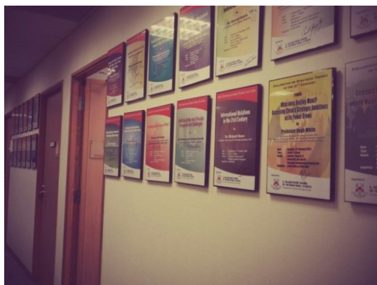
Photo 7: The frames in the lobby of RSIS at NTU have been neatly displayed

Traffic, Transportation and costs: As far as transport is concerned, travelling on a public transport is significantly cheaper than most other cities in the world. Taxi fares are not very expensive but owning a car is an expensive affair in Singapore. The Singaporeans are highly disciplined and extremely hardworking people something that is reflected in their mundane activities. Nobody screams when they talk, or talk when they walk.. Eating and drinking inside the train, inside the buses,