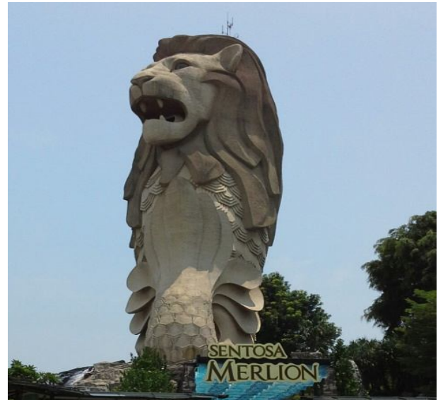
Photo 2: Merlions are supposed to be the Guardian of Prosperity. Sentosa Merlion (37m) is taller than the other four Merlions in Singapore (16.6m). There are supposedly five official Merlion statues recognized by the Singapore government and I managed to be at the Sentosa Island where Sentosa Merlion is located

I set an inerasable itinerary that these ten days trip will be purely for data collection, visiting universities, libraries and think tanks/institutes,