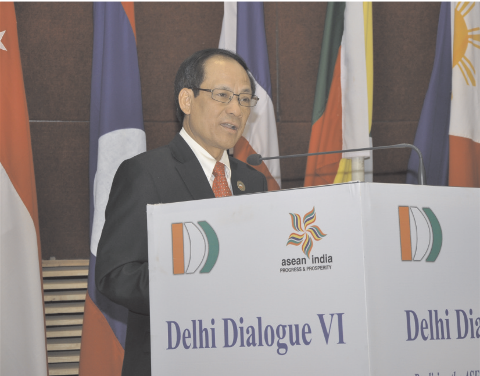
ASEAN Secretary General Mr. Le Luong Minh Addressing the Audience at IDSA on 7 March

Southeast Asia & Oceania Centre Bimonthly Newsletter