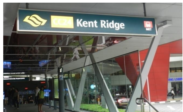
Photo 9: Kent Ridge MRT Station is an underground MRT on the Circle Line

We will not see the line breaking even as the passengers get in and out of the Mass Rapid transit (MRT). Same applies to queues in buses and taxi stands. Things are extremely organized. Above all, besides providing a clean transport, there is safety and security while travelling too. The roads are shiny as if the city has been polished only some minutes ago. The significant investment in their road infrastructure says it all. I just thought to myself, a simple shoe will be wearable for 10 years unless we have thorns on our feet! Singaporeans are very polite people and always willing to help. I was amazed! For a Global Commercial Hub like Singapore, language is not a barrier because almost everyone understands English.