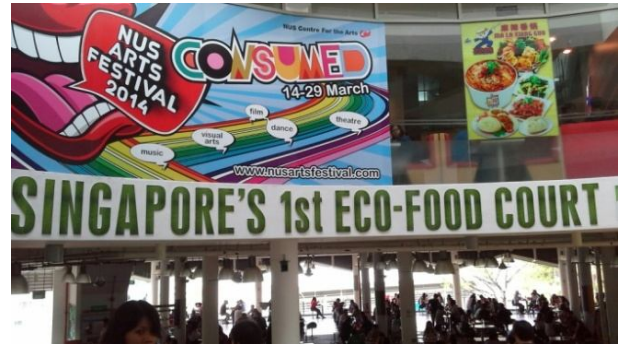
Photo 8: The Deck (Arts Canteen) is Singapore's first eco food court, situated at the Faculty of Arts and Social Sciences at NUS

inside taxis are strictly prohibited. Freedom to dress is uninterrupted. People are well dressed and well mannered.