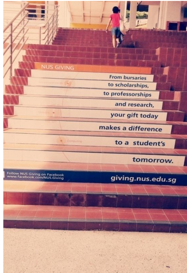
Photo 4: The stairs at National University of Singapore caught my attention

The S. Rajaratnam School of International Studies (RSIS) is an autonomous school within the Nanyang Technological University, Singapore. Research takes place within RSIS' six centres that includes the Institute for Defence and Strategic Studies (IDSS), The International Centre for Political Violence and Terrorism