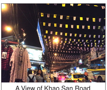
A View of Khao San Road

My hotel was in the vicinity of Khao San Road in Bangkok. The everyday life in Khao San Road begins at seven in the evening, when most of the other shopping complexes such as the electronics market (Pantip Plaza), Gems Gallery and India