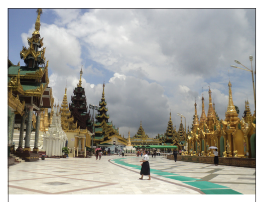
Shwedagon Pagoda, Myanmar's most famous and largest Pagoda(COVER PHOTO).jpg

soft-skills in Myanmar has been highly appreciated in the official circles of Myanmar and they want India to invest more in developing her North-eastern region so that business and trade opportunities across the border can be enhanced. Additionally, they also want India to be a more proactive and prompt in delivering and implementing the projects. On the way to Yangon International Airport, I saw some 50 monks crossing the road in a queue. This discipline, coordination and cooperation are something that today's Myanmar can cherish and re-learn to be a hub of business and trade in the region once again.