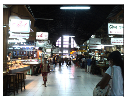
Aung Saan Bogyoke market, Yangon is famous for gems, jewellery and teak and wood products

On the eighth day of my visit, I travelled to Yangon, at an hour's distance by air from Bangkok. Yangon, the former capital of Myanmar is not as bright and stunning as Bangkok, but bears all the signs of becoming a future hub of tourism. In Yangon, I preferred to stay downtown, hoping to gain an experience of British colonial times. From my hotel, I could see a mosque, a church and a pagoda facing each other. Substantial numbers of Indians inhabit the area. According to them, Yangon still has two to four per cent of Indian population. I met two Myanmarese Indians in Yangon and with a shock discovered that both use two names- an Indian name used by their