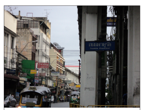
Thanon Phahurat- Area Inhabited by Substantial Number of Indian Descendants

'My first trip abroad!' was my reaction when my forthcoming field trip to Bangkok and Yangon was confirmed. I had studied about Thailand during my M.Phil Dissertation and Myanmar is very much a part of my doctoral thesis. Not surprisingly, I was enthusiastic and mesmerized by the thought of my very first field trip outside India. The next two and half months were gone in a snap of the fingers and there I was, finally, at the Suvarabhumi International Airport, Bangkok. My trip schedule was tight schedule but each day was filled with new experiences and learning.