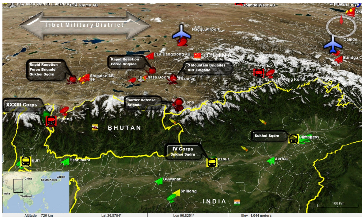
Figure II: China's Military Infrastructure in TAR