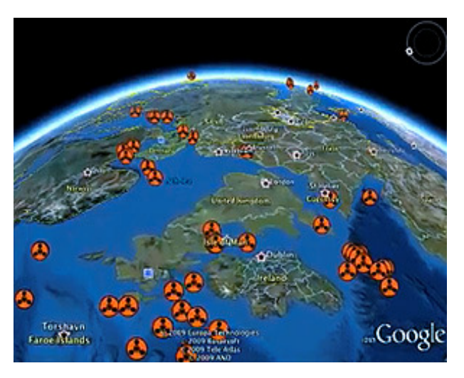
Estimated locations of the Chemical Weapons dumped at Sea.<sup>3</sup>

The biggest questions associated with the issue relate to not only how to deal with the chemical weapons already dumped into the depths but also who should be responsible for the clean-up. As most of these weapons are dumped into waters outside territorial boundaries and borders, it presents a legal as well as logistical challenge in terms of safely in salvaging and destroying them in a manner that that they are no longer harmful to the environment or human health.