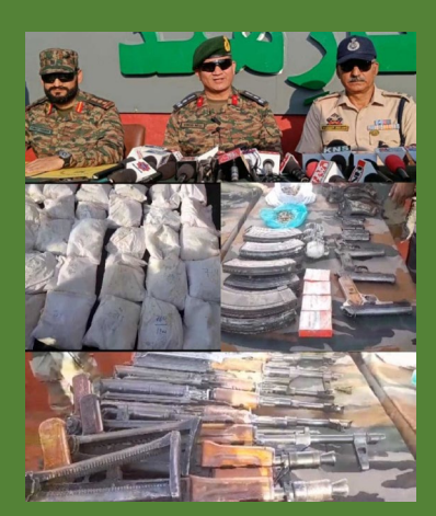
Army personnel display arms and drugs recovered after foiling an infiltration bid in Kupwara

On 23 June 2023, Jammu and Kashmir's police announced that four terrorists were neutralised in Kala Jungle of Machhal sector, Kupwara. This victory was the result of a joint operation by Indian armed forces and police.