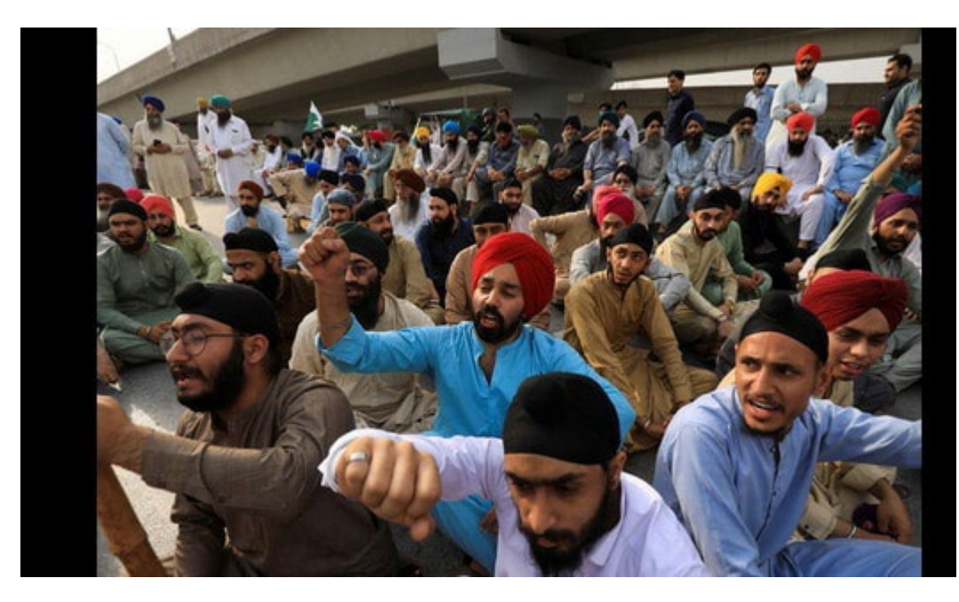
Members of the Pakistan's Sikh community protest after two Sikh men were killed by gunmen, in Peshawar, Pakistan.

4 KILLED IN 3 MONTHS, ISIS CLAIMS RESPONSIBILITY FOR 2 ATTACKS