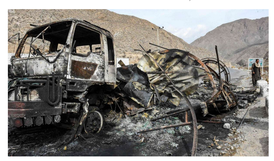
View of the charred truck container torched by Balochistan Liberation Army at central Bolan district, in Balochistan province, on January 30, 2024.

BLA CLAIMS TO HAVE TAKEN CONTROL OF MACH CITY, SURROUNDING AREAS