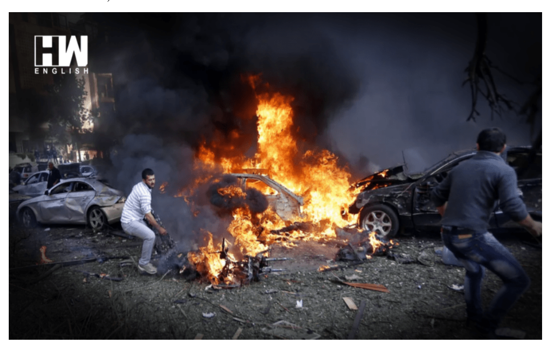
Iranian youth salvaging valuables from the burning wreckage of the bomb blasts that rocked ceremonies marking Oassem Soleimani's assassination in Kerman on 3 January 2024. — HW

OVER 100 KILED, INJURED IN KERMAN IN DEADLIEST ATTACK SINCE REVOLUTION