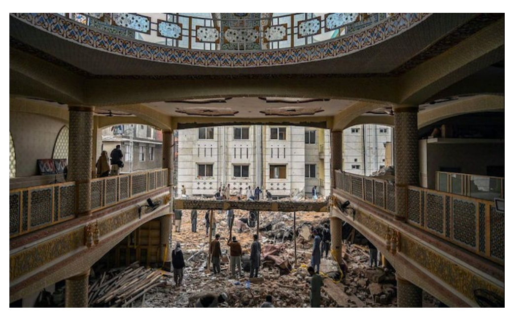
Rescue workers surveying the damage at the mosque in Peshawar Cantt.

O n 30 January 2023, a suicide bomber detonated explosives inside a mosque, which is located inside Peshawar Cantt's most sensitive area, Police Lines. At least 100 individuals were killed and no less than 150 injured during this deadly attack.