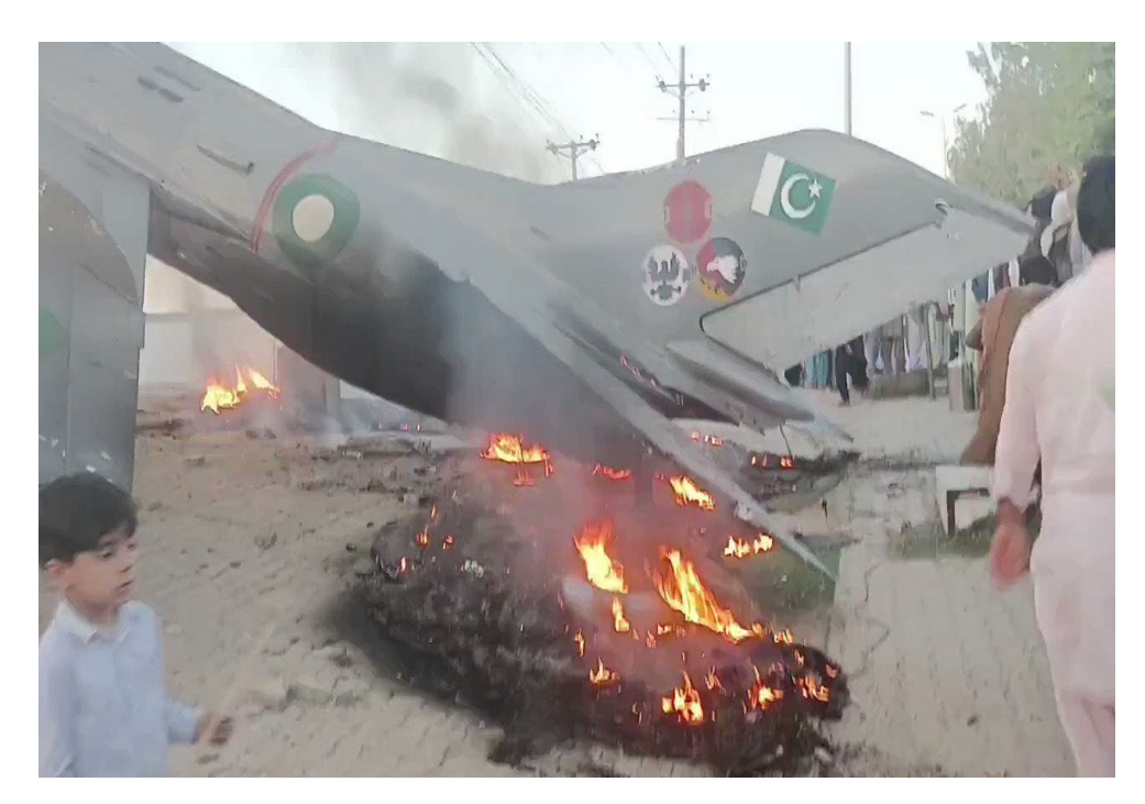
Unverified visual on social media showing a Pakistani military aircraft burning

On 4 November 2023, members of the terrorist organisation, Tehreek-e-Jihad (TeJ) attacked the Mianwali Air Base in Pakistan's Punjab Province, infiltrating the perimetres using ladders.